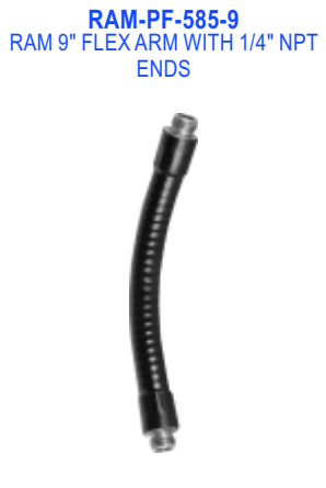
RAM-STRAP40 RAM SS WORM DRIVE STRAP CLAMP-BONANZA