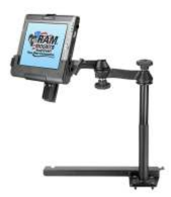
RAM-VB-149-SW1 VEHICLE SYSTEM FOR THE 2005NEWER TOYOTA HIGHLANDER