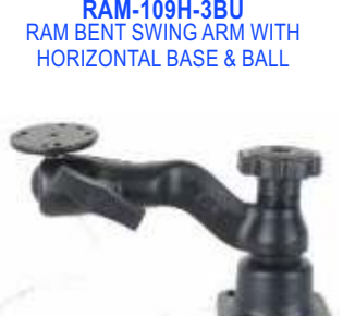
RAM-109H-3BU RAM BENT SWING ARM WITH