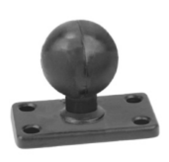
RAM-202U-23 RAM BASE 2" X 3" WITH 1 1/2" BALL