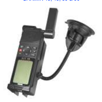
RAP-105-6224-GA3 RAM FLEX ARM MOUNT FOR THE GARMIN 48, 45, 89 & 90