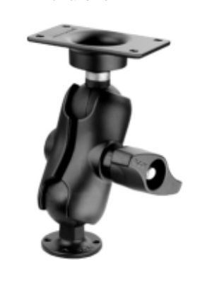
RAM-D-101U-HY2 RAM MOUNT WITH ROUND BASE & 2.5" PLATE