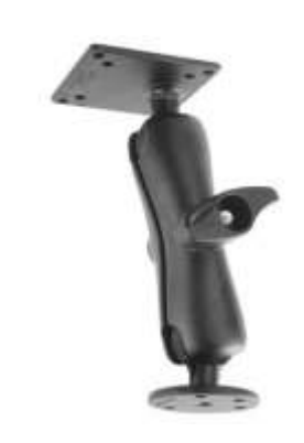
RAM-D-101U-GAM1 RAM MOUNT. D-243, D-201, D-254