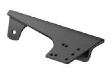
RAM-VB-166-MOT3 VEHICLE SYSTEM FOR THE 2006NEWER FORD EXPEDITION