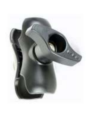
RAM-D-202U-23 RAM BASE 2" X 3" WITH 2 1/4" DIAMETER BALL