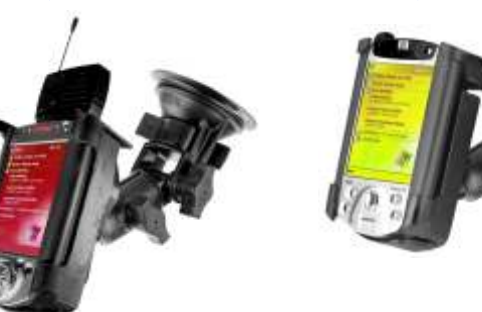
RAP-B-104-224-CO4 RAM RATCHET/PIVOT MOUNT FOR HP IPAQ 1900 & 4100 SERIES