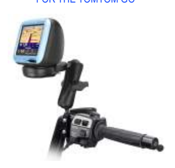
RAM-B-174-UN3 RAM BRAKE/CLUTCH RESERVOIR FOR MEDIUM SIZE DEVICES