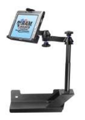
RAM-VB-105-SW1 VEHICLE SYSTEM FOR THE 1997-NEWER DAKOTA & DURANGO