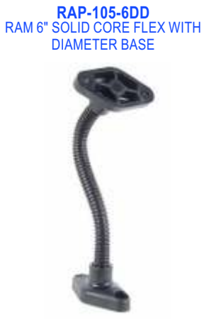
RAP-169-LO2U WEIGHT BASE WITH SOLID FLEX