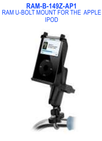
RAM-B-149ZAU RAM RAIL MOUNT WITH A SIZE ARMS