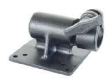
RAM-D-247U-17 RAM CLAMP BASE WITH BALL 1.7" MAXIMUM WIDTH