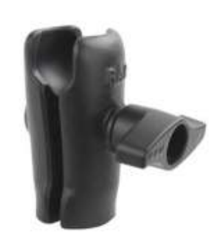
RAM-D-202U RAM 3.68" DIAMETER BASE