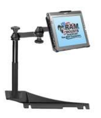
RAM-VB-161-SW1 VEHICLE SYSTEM FOR THE 2006-NEWER FORD 500 & FREESTYLE