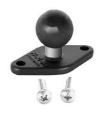
RAM-B-202WU WHITE RAM 2 7/16" DIAMETER BASE WITH 1" BALL