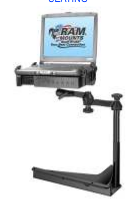
RAM-VB-166 VEHICLE BASE FOR THE 2006-NEWER FORD EXPEDITION