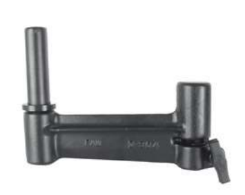
RAM-D-261U RAM SINGLE SWING ARM BALL SOCKET 1" PIPE