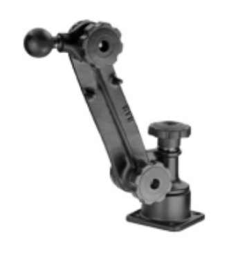
RAM-200-CHU RAM SINGLE SOCKET ARM WITH 1/2" FEMALE HOLE