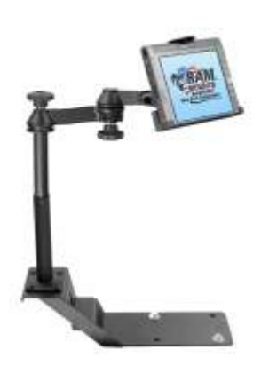
RAM-VBD-122-SW1 VEHICLE SYSTEM UNIVERSAL SQUARE BASE