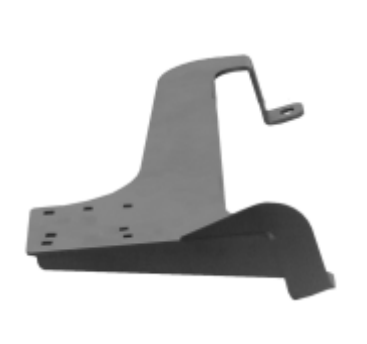
RAM-VB-151-MOT3 VEHICLE SYSTEM SEATS INC.