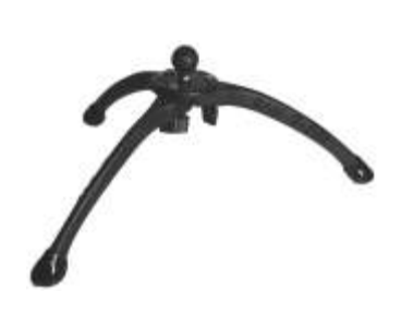
RAM-B-218-1 RAM SINGLE BALL WITH 1/4" NPT. HOLE