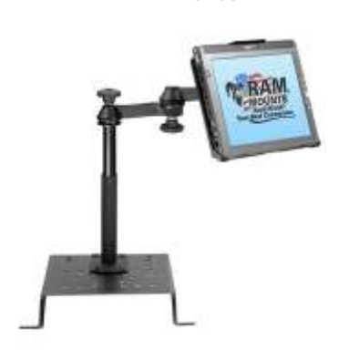
RAM-VB-116-SW1 VEHICLE SYSTEM FOR THE 2004-NEWER COLORADO