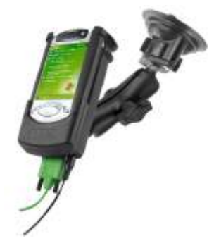
RAM-B-166-CO4P RAM SUCTION MOUNT POWERED DOCK FOR THE HP IPAQ 1900 & 4100