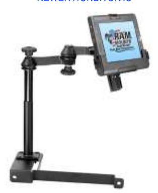
RAM-VB-156-SW1 VEHICLE SYSTEM FOR THE 2005- NEWER KIA OPTIMA & HYUNDIA