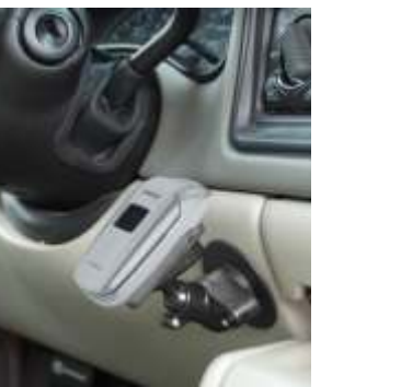
RAP-SB-190U RAM 2.5"DIA & DIAMOND BASE SNAP LINK MOUNT