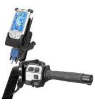
RAM-B-174-G3U RAM BRAKE/CLUTCH RESERVOIR FOR THE GARMIN 7200