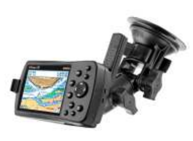
RAP-B-104-224-GA7 RAM RATCHET/PIVOT MOUNT FOR THE GARMIN 176, 276 & 296