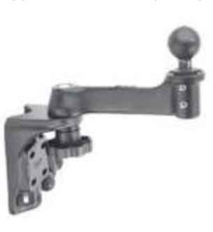
RAM-109V-2BU RAM SWING ARM SYSTEM WITHOUT DOUBLE ARM AND VERTICAL BASE