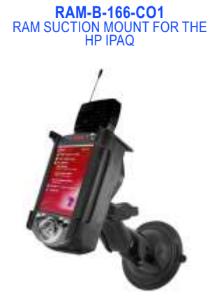
RAM-B-166-CO3P RAM SUCTION MOUNT POWERED DOCK FOR THE HP IPAQ 2000 SERIES