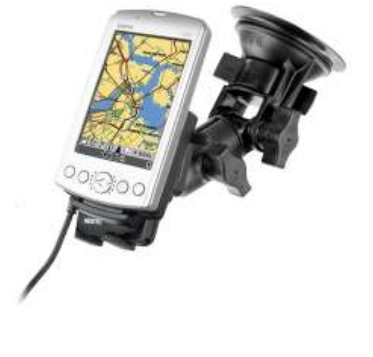
RAP-B-104-224-GA16 RAM RATCHET/PIVOT MOUNT FOR THE GARMIN ETREX COLOR