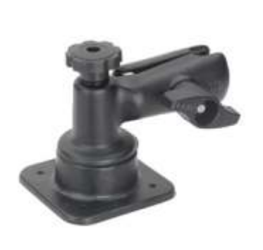
RAM-D-162SAU RAM SWIVEL BASE WITH SINGLE SOCKET ARM