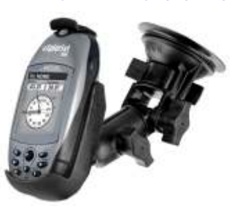
RAP-B-104-224-MA5 RAM RATCHET/PIVOT MOUNT FOR THE MAGELLAN EXPLORIST SERIES