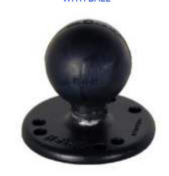
RAM-202U-153 RAM BASE 1.5" X 3" WITH 1 1/2" BALL