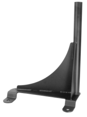
RAM-VB-144-MOT3 VEHICLE SYSTEM FOR THE 2006- NEWER KIA SORENTO