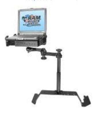
RAM-VB-105 VEHICLE BASE FOR THE 1997-NEWER DAKOTA & DURANGO