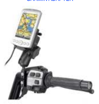
RAM-B-174-GA16 RAM BRAKE/CLUTCH RESERVOIR FOR THE GARMIN ETREX COLOR