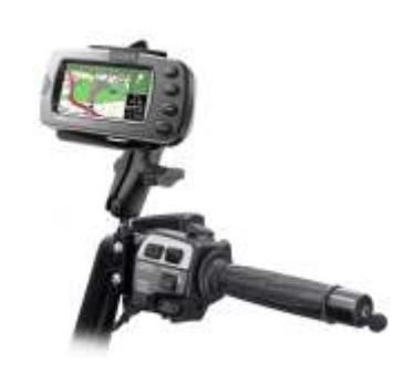
RAM-B-174-LO5 RAM BRAKE/CLUTCH RESERVOIR FOR THE LOWRANCE IFINDER GO