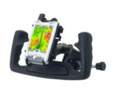
RAM-B-125B-G1U RAM FOR YOKES WITH MOUNTING HARDWARE