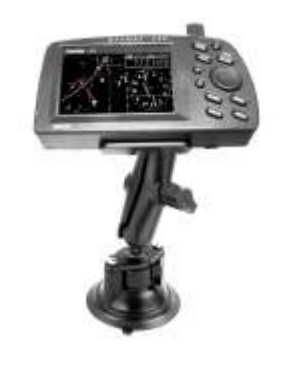
RAM-B-166-GA12 RAM SUCTION MOUNT FOR THE GARMIN 60 SERIES