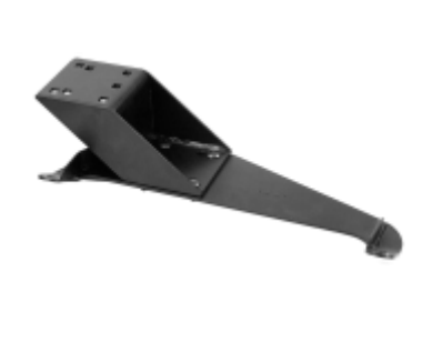
RAM-VB-138-MOT3 VEHICLE SYSTEM FOR THE 2006-NEWER TOYOTA 4-RUNNER