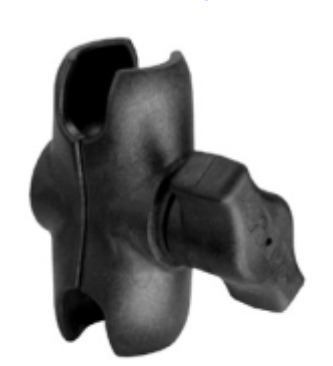
RAP-B-224-138U RAM 3.3" DIAMETER SUCTION CUP WITH ARM ASSEMBLY