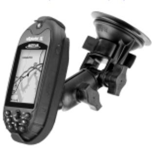
RAP-B-104-224-MA6 RAM RATCHET/PIVOT MOUNT FOR THE MAGELLAN EXPLORIST XL