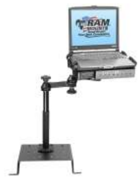
RAM-VB-117 VEHICLE BASE FOR THE 1993-NEWER CAMARO & 1991-NEWER CROWN VIC