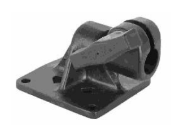
RAM-246-AD1U RAM 4.75 SQ. VESA BASE NO SCREW BUSH