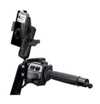
RAM-B-174-CO1 RAM BRAKE/CLUTCH RESERVOIR FOR THE HP IPAQ 3600 & 5000 SERIES