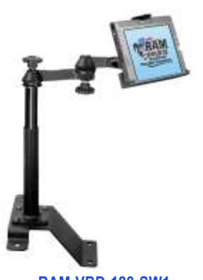
RAM-VBD-128-SW1 RAM UNIVERSAL DRILL TYPE FLAT VERTICAL BASE