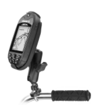
RAM-B-149Z-PD3 RAM RAIL MOUNT UNIVERSAL PDA