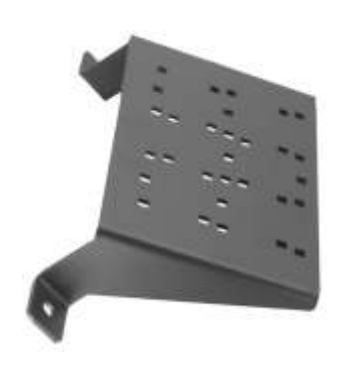
RAM-VB-116-MOT3 VEHICLE SYSTEM FOR THE 2004- NEWER COLORADO