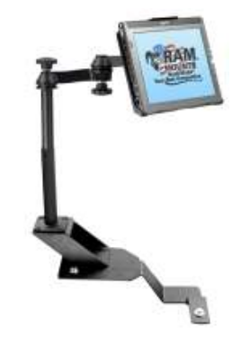
RAM-VB-103-SW1 VEHICLE SYSTEM FOR THE 1500, 2500, 3500 SILVERADO