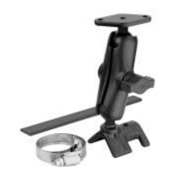
RAM-B-111U-A RAM MARINE ELECTRONICS SHORT ARM