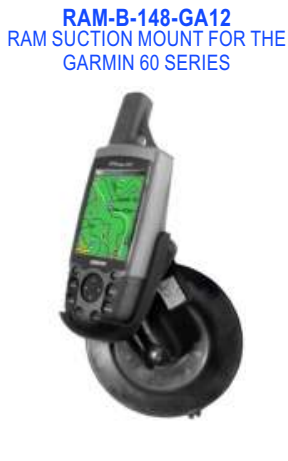
RAM-B-148-GA2 RAM SUCTION MOUNT FOR THE GARMIN GPS II & II