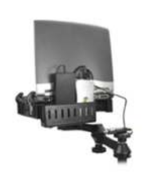
RAM-234-PAN1P RAM PANASONIC LAPTOP MOUNT TOUGH TRAY PLAST