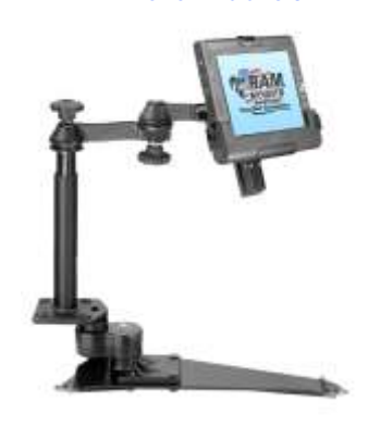
RAM-VB-139 VEHICLE BASE FOR THE 2004-NEWER HONDA ACCORD