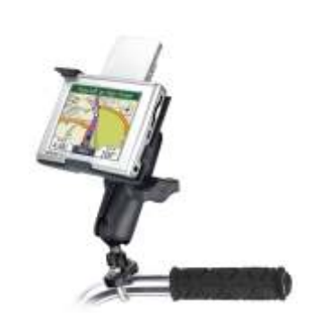
RAM-B-149Z-GA5 RAM MOUNT WITH U-BOLT FOR THE GARMIN E-TREX