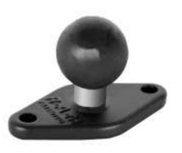
RAM-B-238U-500 500 BULK 2-7/16" X1-5/16" BASES WITH BALL