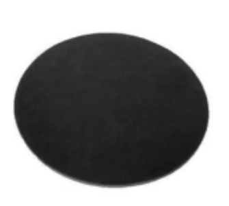
RAM-202U-1525 RAM BASE 1.5" X 2.5" WITH 1 1/2" BALL