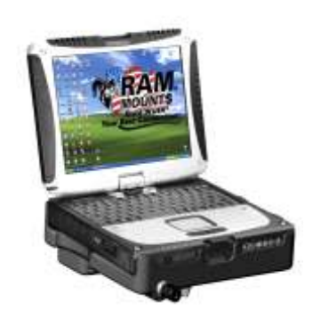
RAM-235 RAM BASE WITH 2 U-BOLTS FOR 3/4 TO 1 1/4