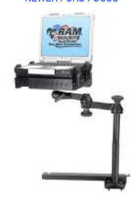
RAM-VB-150 VEHICLE BASE FOR THE 2005-NEWER SCION XB