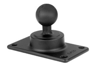
RAM-246-247U-25 RAM MOUNT VESA PLATE SQUARE TUBE