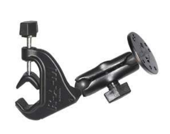
RAM-B-121-CO1 RAM YOKE MOUNT FOR HP IPAQ