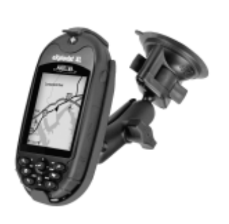
RAM-B-166-PD3 RAM SUCTION MOUNT UNIVERSAL PDA