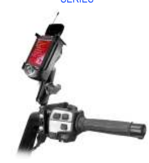
RAM-B-174-CO3P RAM BRAKE/CLUTCH RESERVOIR POWERED DOCK FOR THE HP IPAQ 2000 SERIES