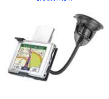
RAP-105-6224-GA21 RAM FLEX ARM MOUNT FOR THE GARMIN NUVI