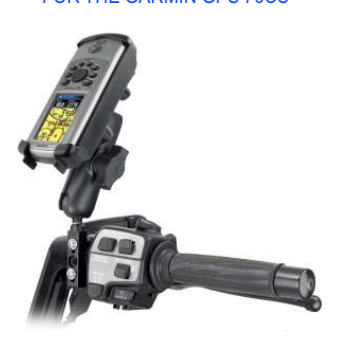
RAM-B-174-GA2 RAM BRAKE/CLUTCH RESERVOIR FOR THE GARMIN 2, 3 & 5