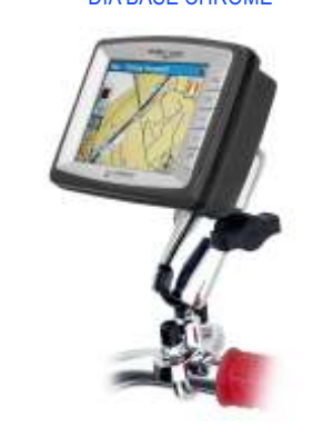
RAM-B-149Z-237U RAM RAIL MOUNT WITH 1/4"-20 MALE