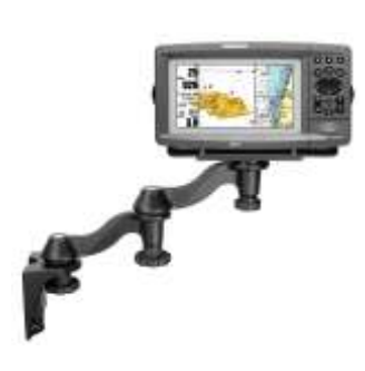
RAM-109V-1 RAM DOUBLE SWING ARM MOUNT SYSTEM WITH VERTICAL BASE