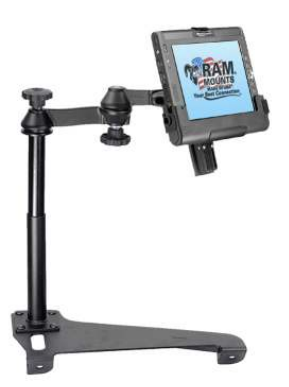
RAM-VB-140-SW1 VEHICLE SYSTEM NATIONAL SEATING