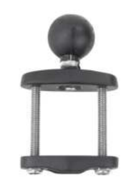
RAM-251-1SA RAM 9" X 9" ALUMINUM BASE WITH 4 HOLES