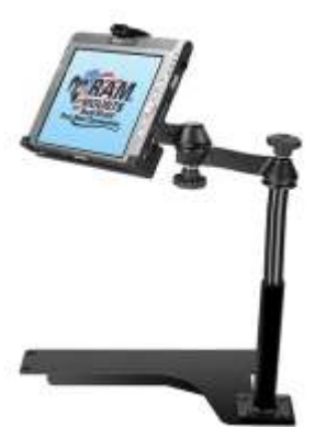
RAM-VB-158-SW1 VEHICLE SYSTEM FOR THE 2005-NEWER JEEP WRANGLER