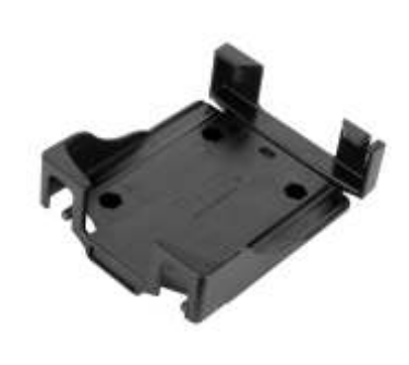
RAM-HOL-TD1U RAM HOLDER FOR THE TDS RECON