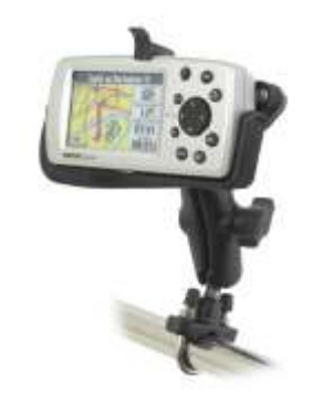
RAM-B-149Z-GA20U RAM U-BOLT FOR THE GARMIN RINO 530 & 520