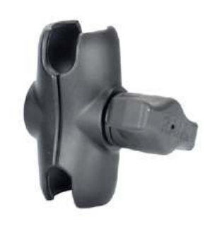
RAM-B-201U-125 125 BULK PACKAGED DOUBLE SOCKET ARMS FOR 1" BALL