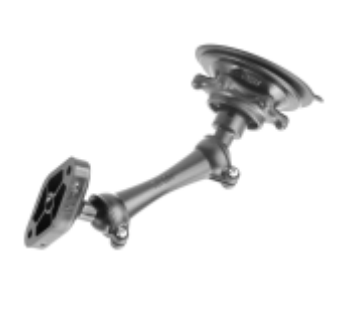
RAP-B-101 RAM MOUNT WITH 2 RAM-B-202 BASES & 2 ½" DIAMETER ARM