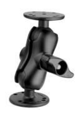
RAM-101U-2461 RAM MOUNT WITH VESA PLATE 75