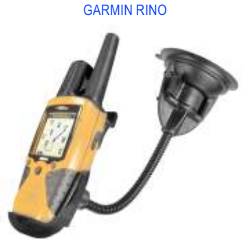
RAP-105-6224-GA8 RAM FLEX ARM MOUNT FOR THE