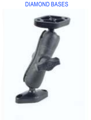
RAP-B-102 RAM DOUBLE BALL MOUNT WITH