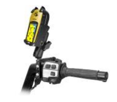
RAM-B-174-GA21 RAM BRAKE/CLUTCH RESERVOIR FOR THE GARMIN NUVI