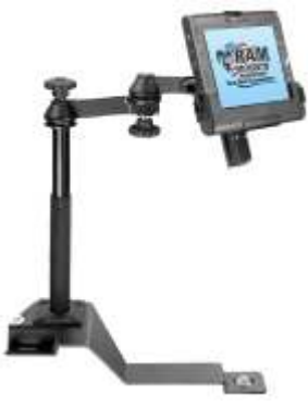
RAM-VB-115-SW1 VEHICLE SYSTEM FOR THE 1995- NEWER TAURUS