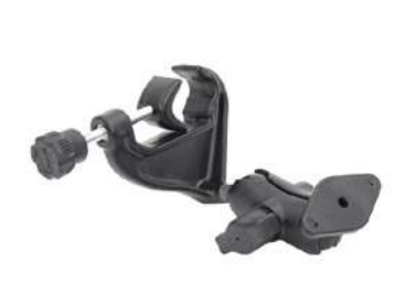
RAP-B-121-OT1U RAM YOKE MOUNT WITH BALL & ARM ASSEMBLY