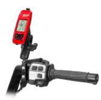
RAM-B-174-MA3 RAM BRAKE/CLUTCH RESERVOIR FOR THE MAGELLAN SPORTRAK