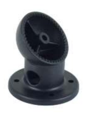
RAP-292U 2" X 6 1/4" BASE WITHOUT OCTAGON BUTTON