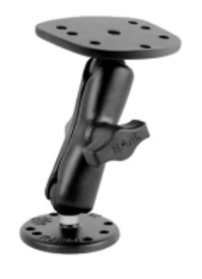
RAM-B-108-238 RAM STRAP CLAMP MOUNT WITH DIAMOND BASE