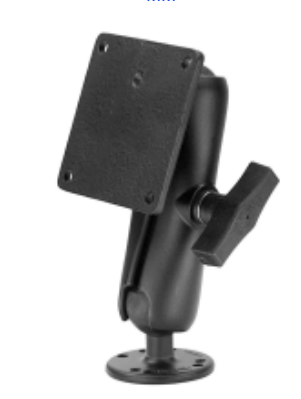
RAM-101U-BL RAM MOUNT. WITH 2 2 1/2" & B ARM