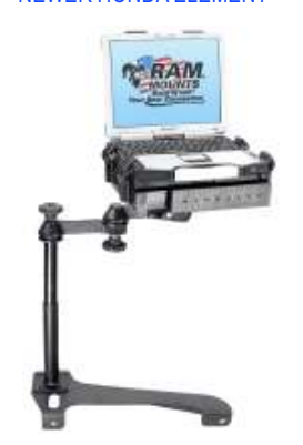
RAM-VB-136-MOT3 VEHICLE SYSTEM FOR THE 2005-NEWER ASTRO VAN