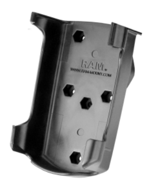
RAM-HOL-CO3U RAM HOLDER FOR THE HP IPAQ 2000 SERIES