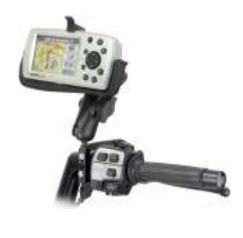
RAM-B-174-GA20 RAM BRAKE/CLUTCH RESERVOIR FOR THE GARMIN RINO 520 & 530