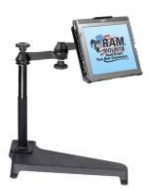
RAM-VB-138ST1-MOT1 VEHICLE SYSTEM FOR THE 2006-NEWER TOYOTA FJ CRUISER