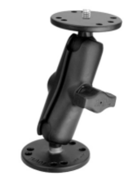
RAM-B-101A2U RAM MOUNT WITH 2-B-202A BASES