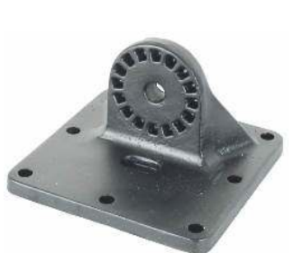
RAM-283U RAM 5" X 5" BASE WITH MALE POST FOR TEL POST