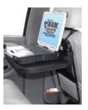
RAM-234-PAN1M RAM PANASONIC LAPTOP MOUNT TOUGH TRAY METAL