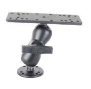
RAM-114BM RAM ROD 2000 BULKHEAD MOUNTING BASE