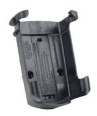
RAM-HOL-CO4 RAM HOLDER IPAQ FOR THE HP IPAQ 1900 & 4100 SERIES