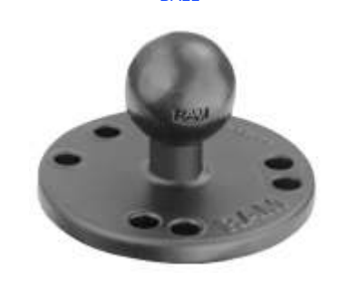
RAM-B-202-G2U RAM BASE & BALL WITH GARMIN MOUNTING HARDWARE