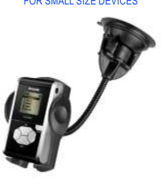
RAP-105-6224-UN1 RAM UNIVERSAL FLEX ARM MOUNT FOR SMALL SIZE DEVICES