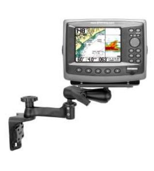
RAM-109V-2 RAM SWING ARM WITH RAM BALL SYSTEM AND VERTICAL BASE