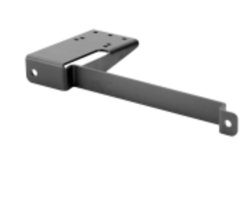
RAM-VB-156-MOT4 VEHICLE SYSTEM FOR THE 2005-NEWER KIA OPTIMA & HYUNDIA