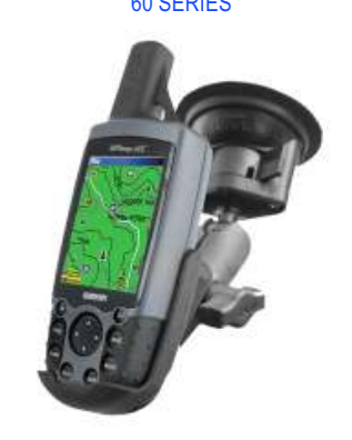
RAP-B-166-PD3U RAM SUCTION SYSTEM UNIVERSAL PDA SERIES