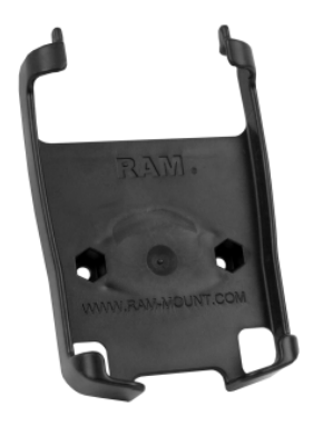
RAM-HOL-CO5P RAM POWERED UNIVERSAL IPAQ DOCK