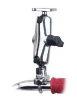
RAM-B-149ZA-C1U RAM MOUNT WITH SHORT ARM AND 1/4"-20