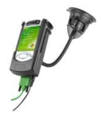
RAP-105-6224-CO4P RAM FLEX ARM MOUNT POWERED DOCK FOR THE IPAQ 1900 & 4100