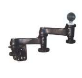
RAM-109V-1BU RAM DOUBLE SWING ARM WITH 1 1/2"AND VERTICAL BASE BALL