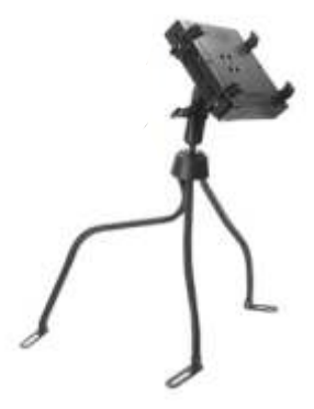
RAM-316LU RAM POD 30" EXTRA LEG