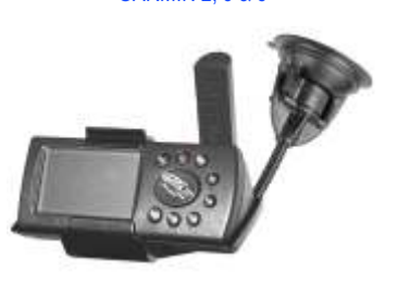
RAP-105-6224-GA2 RAM FLEX ARM MOUNT FOR THE GARMIN 2, 3 & 5