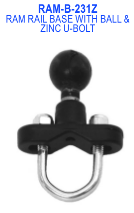
RAM-B-232-90 RAM 2 1/2" DIAMETER BASE WITH 1/4" NPT HOLE 90 DEGREE