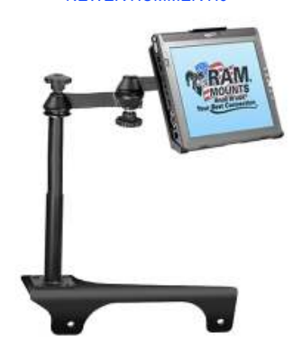
RAM-VB-166-SW1 VEHICLE SYSTEM FOR THE 2006NEWER FORD EXPEDITION