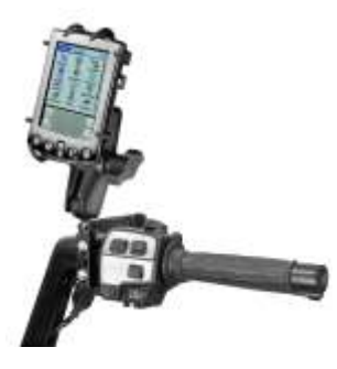
RAM-B-174-UN1 RAM BRAKE/CLUTCH RESERVOIR FOR SMALL SIZE DEVICES