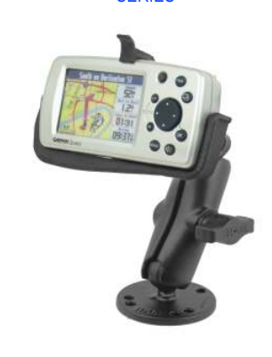
RAM-B-138-GA20 RAM MOUNT FOR GARMIN RINO 520 AND 530