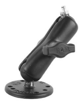
RAM-B-101-A-237U RAM MOUNT WITH 1 1/4"-20 BASE & 1 SHORT ARM