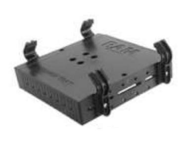
RAM-234-LU RAM USB COMPUTER LIGHT