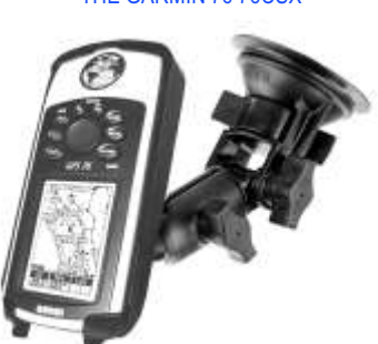
RAP-B-104-224-GA6 RAM RATCHET/PIVOT MOUNT FOR THE GARMIN 76 76CSX