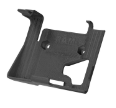
RAM-HOL-GA5 RAM HOLDER FOR THE GARMIN E-TREX