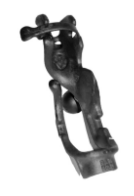
RAM-119-23U RAM TUBE FISHING ROD HOLDER WITH 2 X 3 BASE