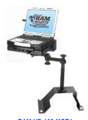
RAM-VB-108-MOT4 VEHICLE SYSTEM FOR THE 2000-NEWER EXCURSION & 1999-NEWER