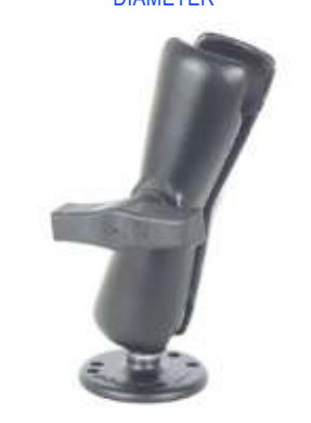
RAM-107B RAM BASE FOR THE HUMMINBIRD & APELCO 97