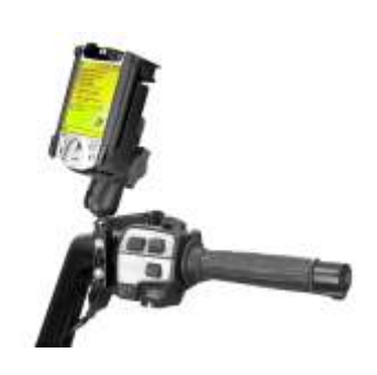
RAM-B-174-CO4 RAM BRAKE/CLUTCH RESERVOIR FOR THE HP IPAQ 1900 & 4100 SERIES