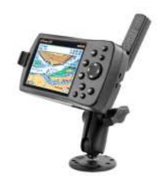
RAM-B-138-LO1 RAM MOUNT FOR THE LOWRANCE GLOBALMAP AND AIRMAP SERIES