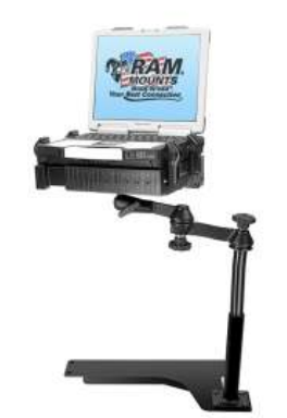
RAM-VB-159 VEHICLE BASE FOR THE 2007 CHEVY TAHOE