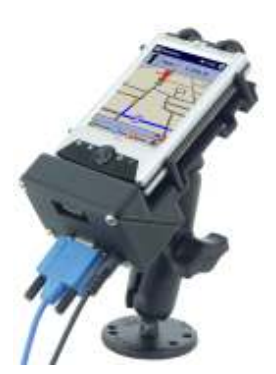
RAM-B-138-GA11 RAM MOUNT GARMIN ADAPTER