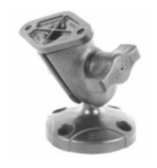
RAP-B-121-A-238U RAM YOKE MOUNT WITH SHORT ARM DIAMETER BASE