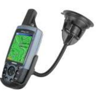
RAP-105-6224-GA12 RAM FLEX ARM MOUNT FOR THE GARMIN 60 SERIES