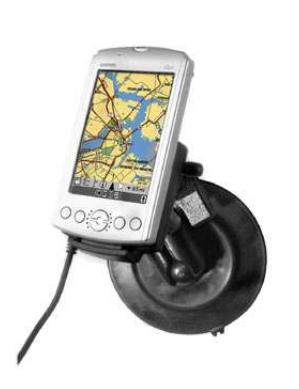
RAM-B-148-GA16U RAM SUCTION FOR THE GARMIN ETREX COLOR