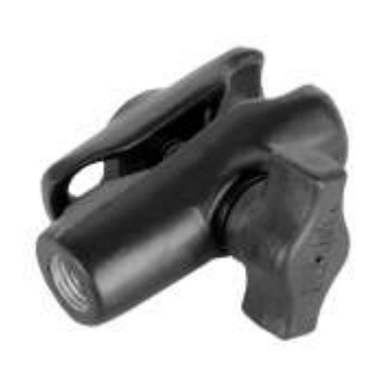
RAM-B-201-ACHU CHROME RAM DOUBLE SOCKET ARM B BALL A LENGTH

RAM-B-200-1 RAM SINGLE BALL SOCKET ARM FOR