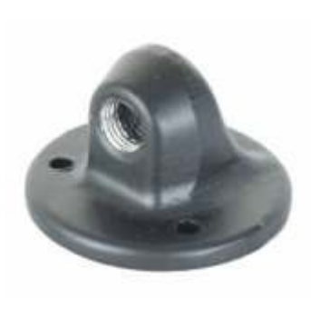
RAM-B-236U RAM BALL WITH 3/8-16 THREAD POST