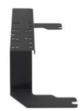
RAM-VB-104-MOT3 VEHICLE SYSTEM FOR THE RAM 1500 & RAM 2500/3500