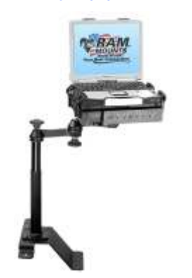
RAM-VB-REM1 RAM VEHICLE REMOVE-A-POLE BASE