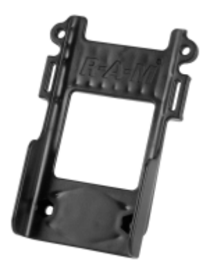
RAM-HOL-CO3P RAM POWERED DOCK FOR THE HP IPAQ 2200 SERIES