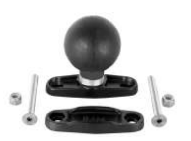
RAM-D-247U-2GL1 RAM CLAMP BASE WITH BALL 2" MAXIMUM GRADE 8