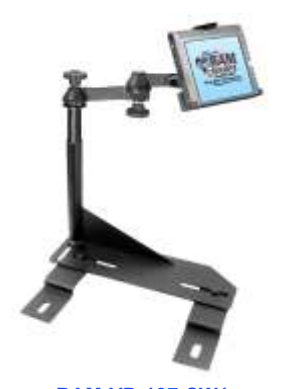
RAM-VB-127-SW1 VEHICLE SYSTEM FOR THE 19942002 RAM 2500 & 3500