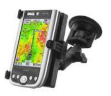
RAP-B-200-12U RAM VARIABLE SWIVEL ARM