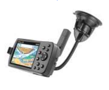
RAP-105-6224-GA7 RAM FLEX ARM MOUNT FOR THE GARMIN 176, 276 & 296