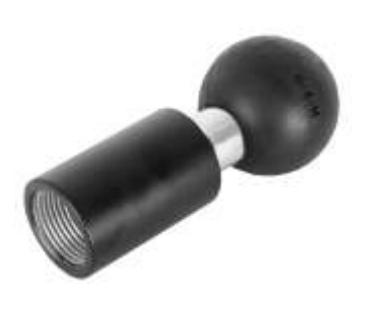
RAM-D-235U RAM WITH 2 U-BOLTS FOR 3/4 TO 1 1/4