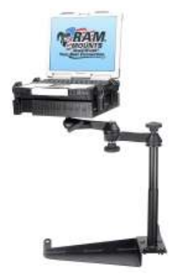
RAM-VB-135MH1-SW1 VEHICLE SYSTEM FOR THE 2006-NEWER HONDA ELEMENT