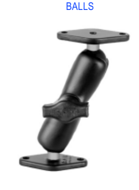
RAM-B-102 RAM EVERYTHING MOUNT WITH 1"