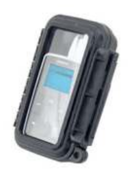
RAM-HOL-CO2P RAM POWERED DOCK FOR THE HP IPAQ 3000 & 5000 SERIES