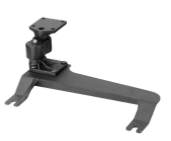
RAM-VB-131R4-MOT1 VEHICLE SYSTEM FOR THE 2000-NEWER 2500 & 3500 SU POWER