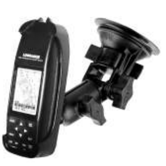
RAP-B-104-224-LO1 RAM RATCHET/PIVOT MOUNT FOR THE LOWRANCE GLOBALMAP