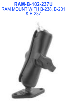
RAM-B-107B RAM 1" BASE FOR HUMMINBIRD & APELCO 97