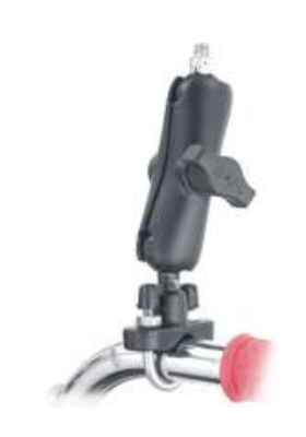
RAM-B149ZA-GA4 RAM U-BOLT MOUNT WITH A ARM FOR THE GARMIN E-MAP