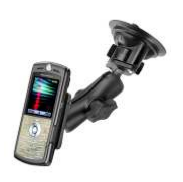
RAM-B-166-AQ2 RAM SUCTION MOUNT MEDIUM SIZE AQUA BOX