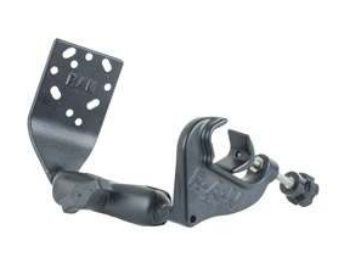
RAM-B-127 RAM WINDOW SCOPE & CAMERA MOUNT