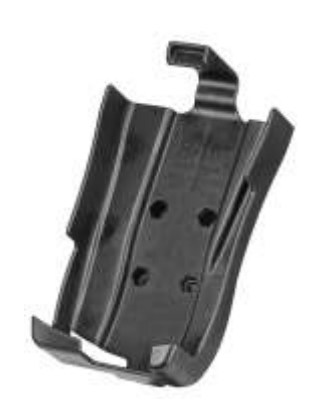
RAM-HOL-QD1U RAM QUICK DRAW SCANNER GUN HOLDER