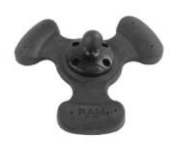
RAP-288U RAM 45 DEGREE ADJUSTABLE BASE WITH FEMALE FOR PIPE