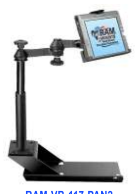
RAM-VB-117-PAN2 VEHICLE SYSTEM TOUGH DOCK CF-18