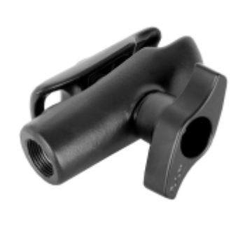
RAM-D-201U-E RAM D SIZE LONG LENGTH ARM