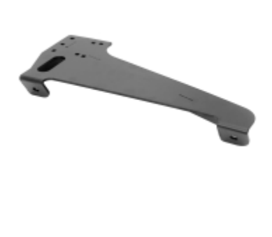
RAM-VB-140-MOT3 VEHICLE SYSTEM NATIONAL SEATING