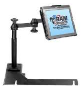
RAM-VB-112-SW1 VEHICLE SYSTEM FOR THE 2002- NEWER EXPLORER