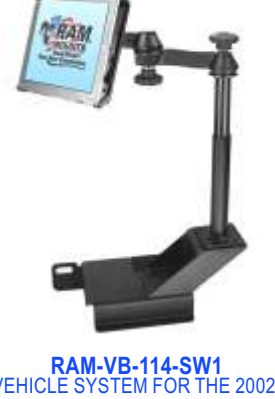
RAM-VB-114-SW1 VEHICLE SYSTEM FOR THE 2002- NEWER TRAIL BLAZER & ENVOY