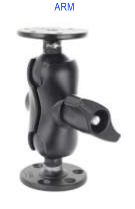
RAM-D-101U-HY1 RAM MOUNT WITH 2" RAIL & 2.5" PLATE