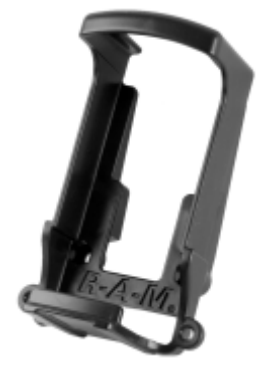
RAM-HOL-LO5 RAM HOLDER FOR THE LOWRANCE IFINDER GO SERIES