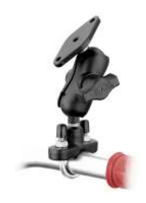
RAM-B-149Z-CO3 RAM U-BOLT MOUNT FOR THE HP 2000 IPAQ