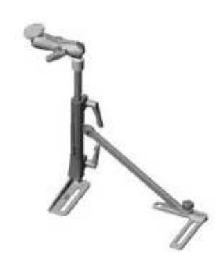
RAM-160BU RAM SEAT RAIL SYSTEM WITH 18"