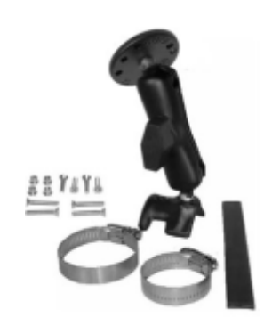
RAM-B-111B RAM UNIVERSAL 6 1/4" X 2" BASE WITH BALL