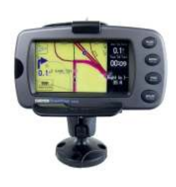
RAP-B-138-MA1 RAM MOUNT FOR THE MAGELLAN 12, 300, 315 & 320