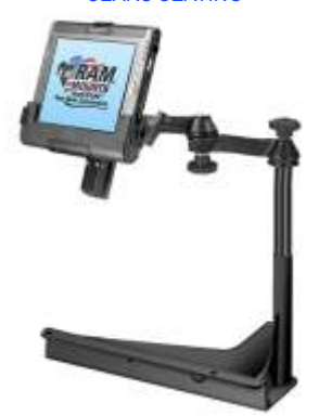
RAM-VB-165-SW1 VEHICLE SYSTEM FOR THE 2006-NEWER HUMMER H3