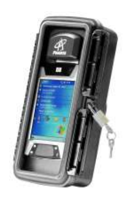
RAM-HOL-CO1 RAM CUSTOM CRADLE HP IPAQ DOUBLE SLOTS