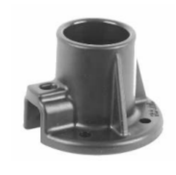
RAP-288FU RAM 45 DEGREE ADJUSTABLE BASE WITH FLANGES