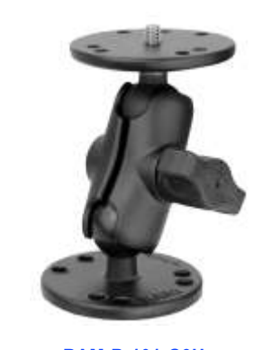
RAM-B-101-G3U RAM MOUNT WITH HARDWARE FOR GARMIN 7200