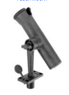
RAM-316-1AU RAM POD I WITH STUD LENGTH LEG