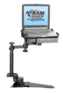
RAM-VB-139-MOT1 VEHICLE SYSTEM FOR THE 2004-NEWER HONDA ACCORD