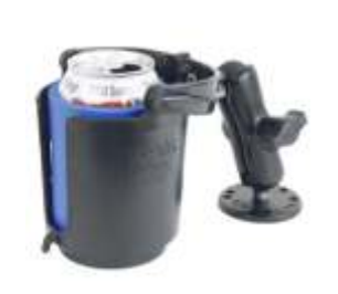
RAM-B-138-AP2 RAM MOUNT WITH 2 7/16" BASE FOR APPLE IPOD NANO