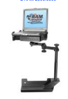
RAM-VB-106 VEHICLE BASE FOR THE 1993-NEWER CAMARO & 1991-NEWER CROWN VIC