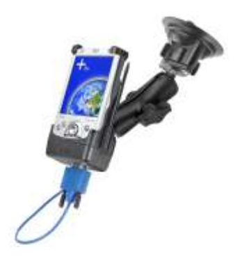
RAM-B-166-DE1 RAM SUCTION MOUNT FOR THE DELL AXIM X5