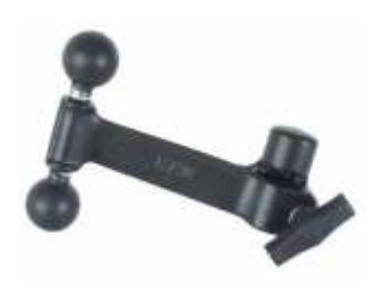
RAM-261-2U RAM 6" SWING ARM PEDESTAL DOUBLE BALL END