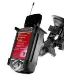
RAP-B-104-224-CO3P RAM RATCHET/PIVOT MOUNT FOR