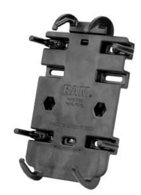
RAM-HOL-UN1 RAM SMALL BLACK MOBILE PHONE HOLDER