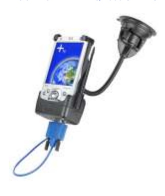
RAP-105-6224-DE1 RAM FLEX ARM MOUNT FOR THE DELL AXIM X5