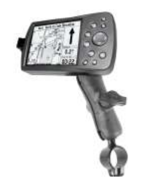
RAP-B-149-MA2 RAM U-BOLT MOUNT FOR THE MAGELLAN MERIDIAN