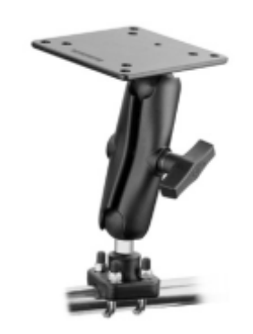
RAM-334U RAM MOUNT WITH RAM-2461 & 1 RAM-235