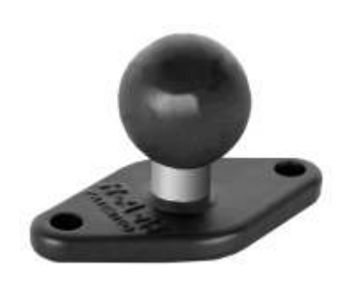
RAM-B-238-TO2U RAM 2 7/16" X 1 5/16" BASE FOR THE TOMTOM RIDER