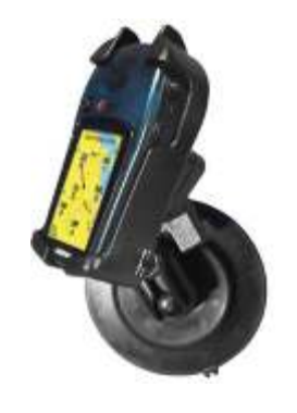
RAM-B-148-GA5 RAM SUCTION MOUNT FOR THE GARMIN E-TREX