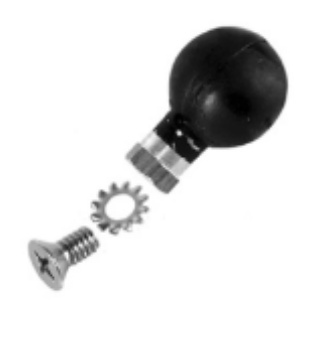
RAM-B-309-6U RAM MODULAR MOTO BASE WITH DOUBLE BALL