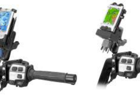
RAM-B-174-GA1 RAM BRAKE/CLUTCH RESERVOIR FOR THE GARMIN GPS 12 SERIES

RAM-B-174-C05P RAM BRAKE/CLUTCH RESERVOIR