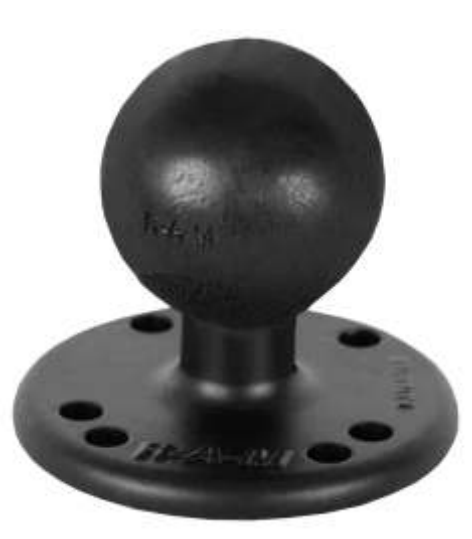
RAM-D-202 D Size Ball 2.25" Diameter