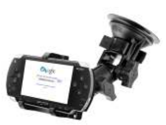
RAP-B-104-224-PD2 RAM RATCHET/PIVOT MOUNT THREE FINDER PDA HOLDER

RAP-B-104-224-UN2 RAM UNIVERSAL RATCHET/PIVOT