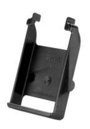
RAM-HOL-AQ3 RAM SMALL SIZE AQUA BOX