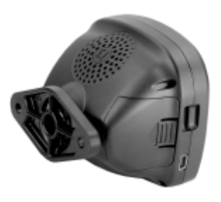
RAM-HOL-GA6 RAM HOLDER FOR THE GARMIN GPS 76 SERIES