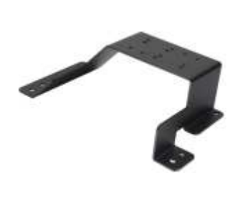
RAM-VB-107-SW1 VEHICLE SYSTEM FOR THE 1990-95 CAPRICE & 1991 CROWN VIC