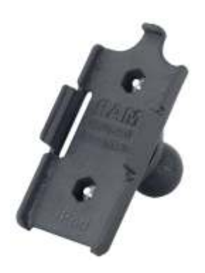
RAM-HOL-BC1 RAM HOLDER FOR ELECTRONICS WITH BELT CLIPS