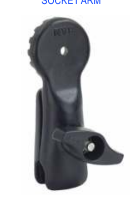
RAM-D-162H-MC3 RAM HORIZONTAL SWING ARM SYSTEM WITHOUT BALL BASE