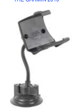
RAP-B-327-LO4 RAM SUCTION MOUNT FOR THE LOWRANCE IWAY 500C