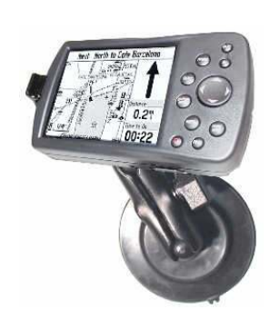
RAM-B-148-MA1 RAM SUCTION MOUNT FOR THE MAGELLAN 12,300,31