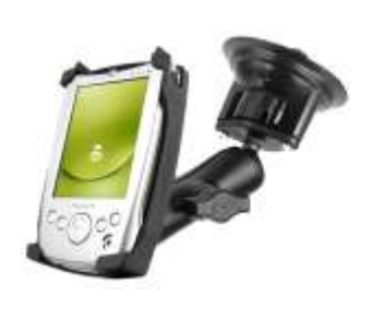
RAM-B-166-GA10 RAM SUCTION MOUNT FOR THE GARMIN IQUE