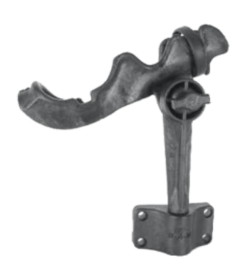
RAM-304B-VP RAM VERTICAL BASE WITH POST