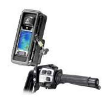
RAM-B-174-CO2 RAM BRAKE/CLUTCH RESERVOIR FOR IPAQ 3000, 5000