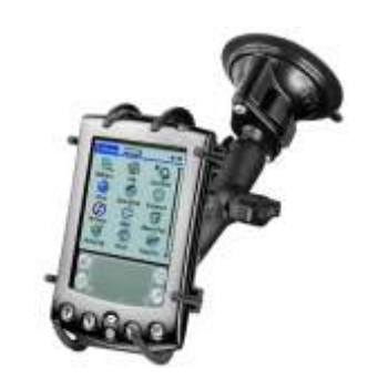
RAM-B-166-UN2 RAM UNIVERSAL SUCTION MOUNT FOR MEDIUM SIZE DEVICES