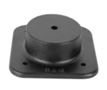
RAM-D-162V1U RAM VERTICAL BOSCH RATCHET SWING ARM BASE