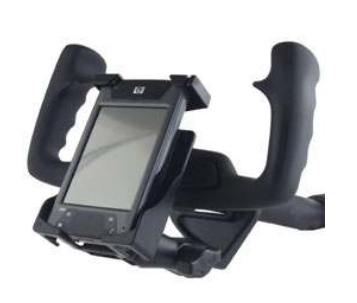
RAM-B-125-BC1 RAM YOKE MOUNT WITH CRADLE FOR BELT CLIPS