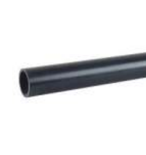
RAP-PP-1112 RAM 1.11 OD X 12" LONG BLACK PVC PIPE