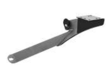
RAM-VB-145-MOT1 VEHICLE SYSTEM CHRYSLER 300 2006- NEWER