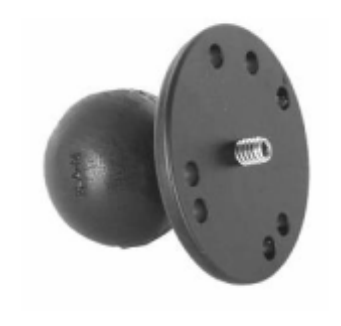
RAM-202U-12 RAM BASE 1" X 2" WITH 1 1/2" BALL