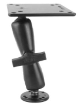
RAM-101U-B RAM MOUNT. WITH 2 2 ½" BASES & B ARM