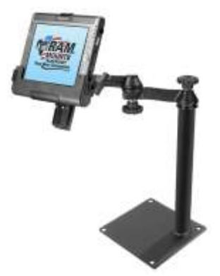
RAM-VBD-126-SW1 RAM DRILL TYPE SPECIFIC TRANS HUMP SYSTEM