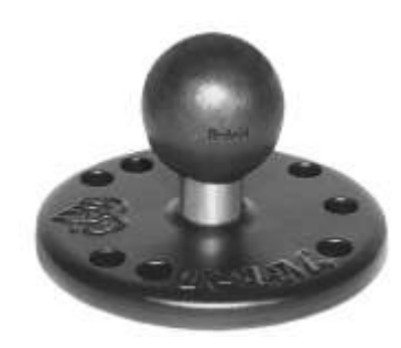
RAM-B-202 B Size Ball 1" Diameter