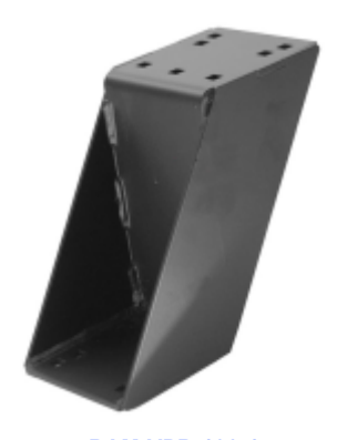
RAM-VPR-103-1 VEHICLE PRINTER SYSTEM FOR THE HP-450