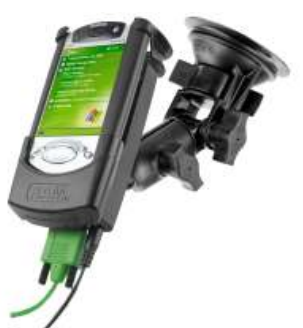
Your Best Connection