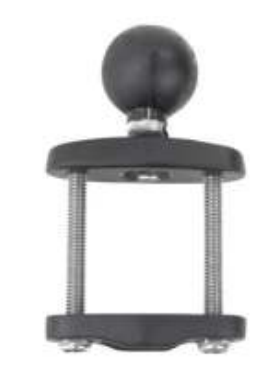
RAM-251-1 RAM 9" X 9" ZINC WEIGHTED BASE WITH 4 HOLES