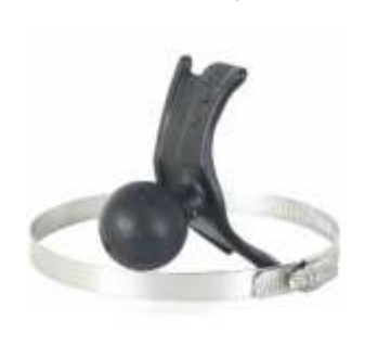
RAM-119B RAM TUBE WITHOUT 1 1/2" DIAMETER BALL & BASE