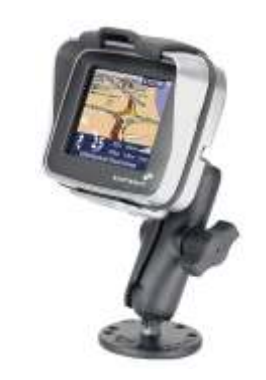
RAM-B-138U-A RAM MOUNT WITH 2.47 DIAMETER 2.47/1.31 BASE WITH A LENGTH ARM