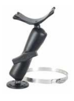
RAM-119-3 RAM TRIPLE DECK & TRACK BASE WITHOUT BALLS