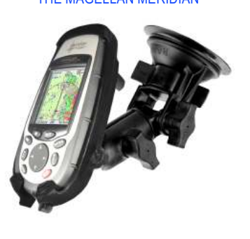
RAP-B-104-224-MA2 RAM RATCHET/PIVOT MOUNT FOR THE MAGELLAN MERIDIAN