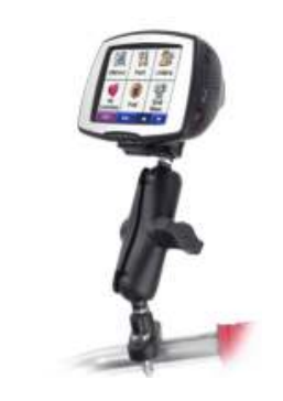
RAM-B-149Z-GA22 RAM U-BOLT FOR THE GARMIN STREETPILOT I SERIES