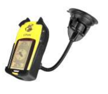
RAP-105-6224-GA5 RAM FLEX ARM MOUNT FOR THE GARMIN E-TREX