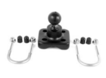
RAM-B-238CHU CHROME RAM 2 7/16" X 1 5/16" BASE WITH BALL