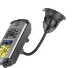
RAP-105-6224-GA14 RAM FLEX ARM MOUNT FOR THE GARMIN 76C