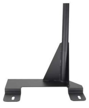
RAM-VB-120-MOT1 VEHICLE SYSTEM FOR THE 2004-NEWER FREESTAR