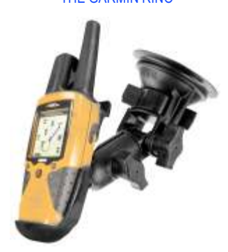
RAP-B-104-224-GA8 RAM RATCHET/PIVOT MOUNT FOR THE GARMIN RINO