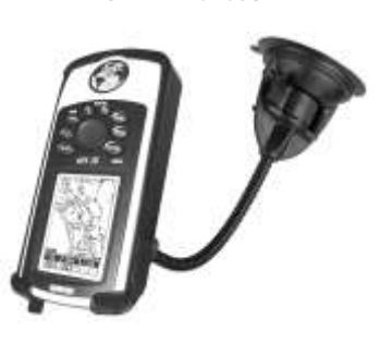
RAP-105-6224-GA6 RAM FLEX ARM MOUNT FOR THE GARMIN 76 76CSX