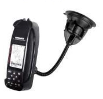
RAP-105-6224-MA1 RAM FLEX ARM MOUNT FOR THE MAGELLAN 12, 300 & 315

RAP-105-6224-MA6 RAM FLEX ARM MOUNT FOR THE