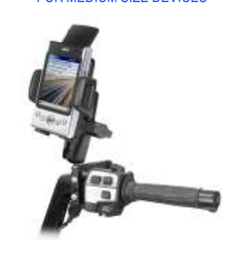
RAM-B-175-AU RAM SEGWAY SYSTEM SHORT ARM