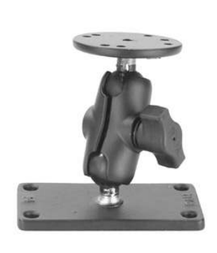
RAM-B-101-C-231ZU RAM MOUNT WITH B-202 AND B-231Z BASE