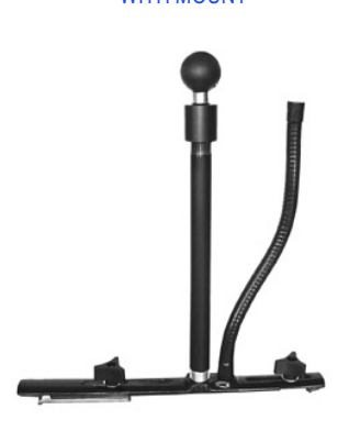
RAM-B-132BU RAM DRINK CUP HOLDER WITH 1" BALL