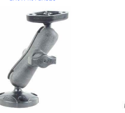
RAP-B-138 RAM MOUNT WITH 2.43 DIAMETER & 2.43 X 1.31 BASES