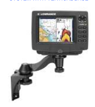
RAM-109V RAM SINGLE SWING ARM MOUNT SYSTEM WITH VERTICAL BASE