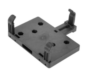
RAM-HOL-TD2U RAM HOLDER FOR THE TDS RANGER