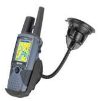
RAP-105-6224-GA20 RAM FLEX ARM MOUNT FOR THE GARMIN RINO 520 & 530