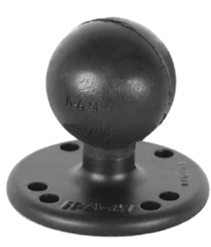
RAM-215 RAM BALL WITH 5/8" HEXAGON HOLE FOR PHOTO