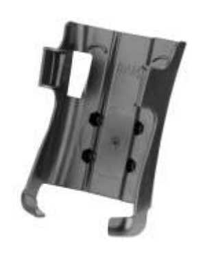
RAM-HOL-UN3 RAM LARGE BLACK MOBILE PHONE HOLDER