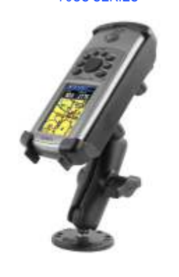
RAM-B-138-GA2 RAM MOUNT FOR GARMIN GPS II & III SERIES