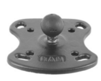
RAM-B-108-G1 RAM WITH V BASE & MOUNTING HARDWARE