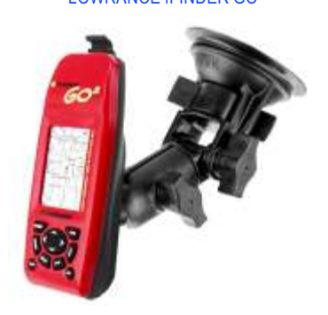
RAP-B-104-224-LO5 RAM RATCHET/PIVOT FOR THE LOWRANCE IFINDER GO