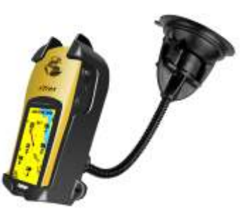
RAP-105-6224-GA16 RAM FLEX ARM MOUNT FOR THE GARMIN ETREX COLOR