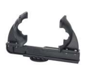
RAM-HOL-UN2 RAM MEDIUM BLACK MOBILE PHONE HOLDER