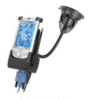
RAP-105-6224-GA10 RAM FLEX ARM MOUNT FOR THE GARMIN IQUE