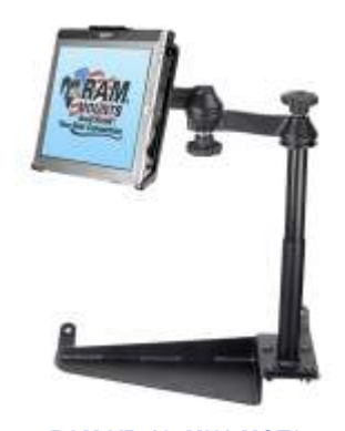
RAM-VB-135MH1-MOT3 VEHICLE SYSTEM FOR THE 2006-NEWER HONDA ELEMENT