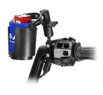
RAM-B-132U RAM DRINK CUP HOLDER MOUNT