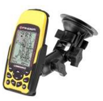
RAP-B-104-224-LO2 RAM RATCHET/PIVOT MOUNT FOR THE LOWRANCE IFINDER