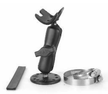
RAM-B-108U-GP1 UNPKD RAM MOUNT WITH B-238 BASE