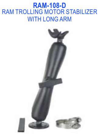
RAM-109-1ATPU RAM SNGLE SWING ARM NO BEND