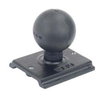
RAM-D-243U 2 13/16" X 5" PLATE WITH BALL