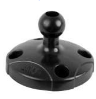
RAP-SB-275-MF RAM SNAP LINK MALE-FEMALE