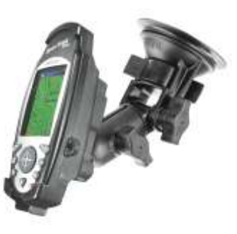
RAP-B-104-224-MA3 RAM RATCHET/PIVOT MOUNT FOR THE MAGELLAN SPORTRAK