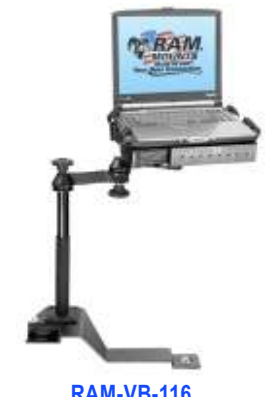
RAM-VB-116 VEHICLE BASE FOR THE 2004-NEWER COLORADO