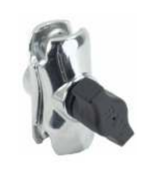
RAM-B-201U-AW WHITE RAM DOUBLE SHORT ARM FOR 1" BALL