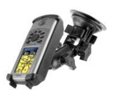
RAP-B-104-224-GA20 RAM RATCHET/PIVOT MOUNT FOR THE GARMIN RINO 520 & 530