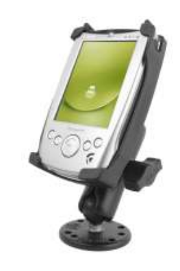
RAM-B-138-GA12 RAM MOUNT FOR GARMIN 60 SERIES