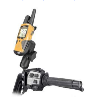
RAM-B-174-LO3 RAM BRAKE/CLUTCH RESERVOIR FOR THE LOWRANCE IFINDER H2O & MAP