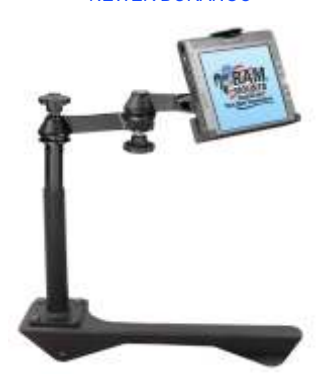
RAM-VB-131A-MOT4 VEHICLE SYSTEM FOR THE 2000-NEWER HUMMER H2