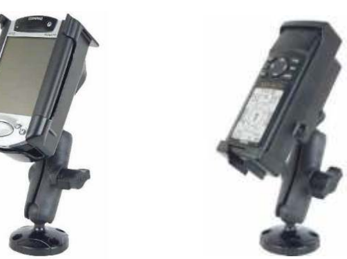
RAP-B-138-GA3 RAM MOUNT FOR THE GARMIN 48, 45, 89, 90 & 92