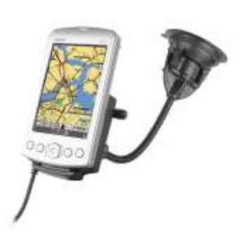
RAP-105-6224-GA11 RAM FLEX ARM MOUNT GARMIN ADAPTER