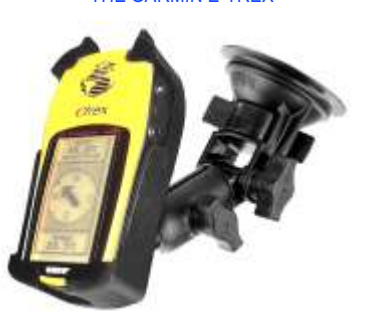
RAP-B-104-224-GA5 RAM RATCHET/PIVOT MOUNT FOR THE GARMIN E-TREX