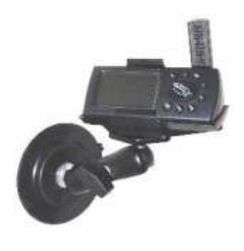
RAM-B-148-GA6 RAM SUCTION MOUNT FOR THE GARMIN GPS 76 SERIES