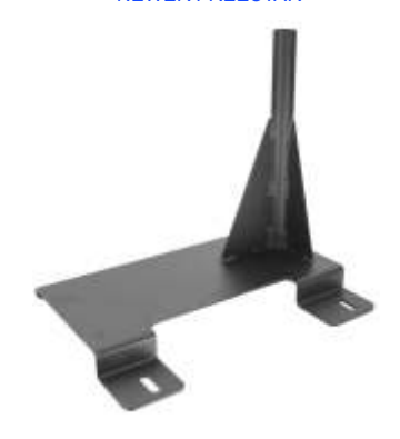
RAM-VB-121-MOT3 VEHICLE SYSTEM FOR THE 1996-NEWER CARAVAN