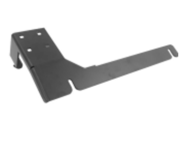
RAM-VB-112-MOT1 VEHICLE SYSTEM FOR THE 2002- NEWER EXPLORER