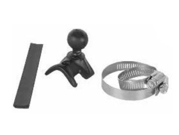
RAM-B-111-238U RAM 6 1/4" BASE MOUNT WITH B-238