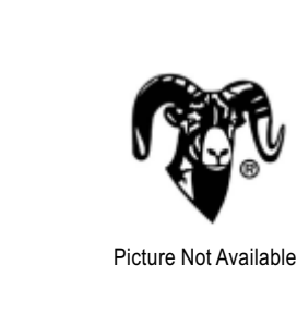
RAM-160LU STABALIZER LEG FOR RAM-160 SERIES