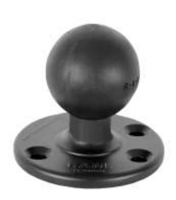
RAM-D-202U-25 RAM 2" X 5" BASE WITH BALL