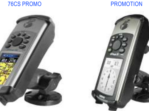
RAP-B-104-RA1 RAM DIAMETER BASE, SINGLE SOCKET, 3/8" STUD