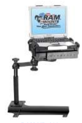
RAM-VB-160 VEHICLE BASE FOR THE 2006-NEWER CHEVY IMPALA