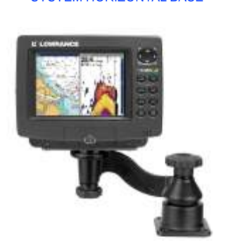
RAM-109H-2BU RAM HORIZONTAL SWING ARM