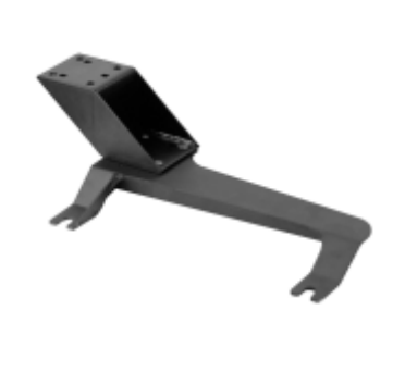
RAM-VB-132 VEHICLE BASE FOR THE 2006-NEWER HONDA RIDGELINE