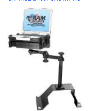
RAM-VB-109 VEHICLE BASE FOR THE 2004-NEWER F150