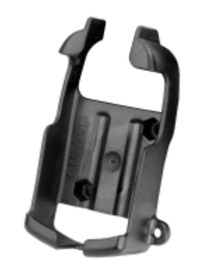
RAM-HOL-GA21U RAM HOLDER FOR THE GARMIN NUVI