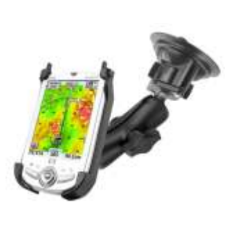
RAM-B-166-G1 RAM SUCTION MOUNT FOR THE GARMIN 195 & 295