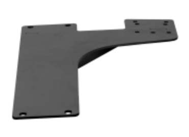
RAM-VB-158-MOT4 VEHICLE SYSTEM FOR THE 2005-NEWER JEEP WRANGLER