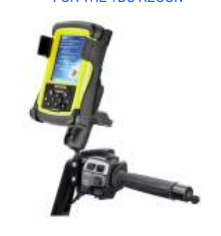
RAM-B-174-UN2 RAM BRAKE/CLUTCH RESERVOIR FOR MEDIUM SIZE DEVICES