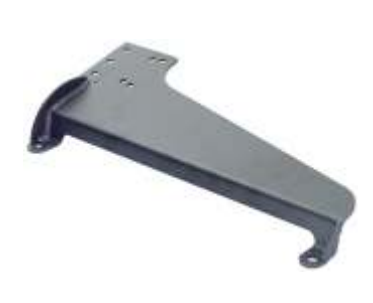
RAM-VB-138ST1 VEHICLE BASE FOR THE 2006-NEWER TOYOTA FJ CRUISER