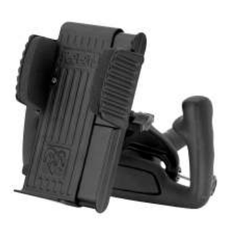
RAM-B-121BAU RAM CLAMP YOKE MOUNTING 1/4"-20