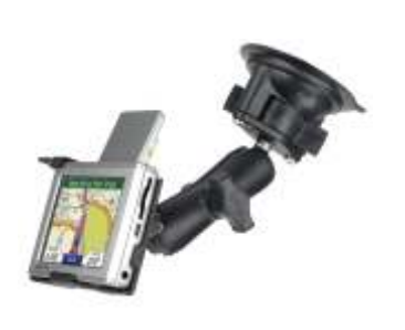
RAM-B-166-GA5 RAM SUCTION MOUNT FOR THE GARMIN E-TREX