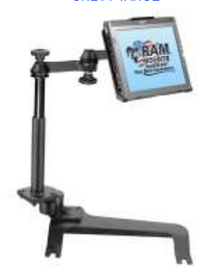
RAM-VB-160-SW1 VEHICLE SYSTEM FOR THE 2006-NEWER CHEVY IMPALA