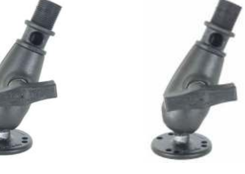
RAM-114DTM RAM ROD 2000 DECK & TRACK MOUNTING BASE