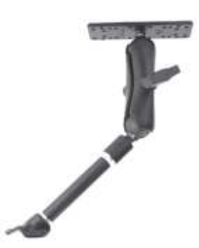
RAM-137U RAM MOUNT WITH 3" X 11" X 2 1/2" BASE