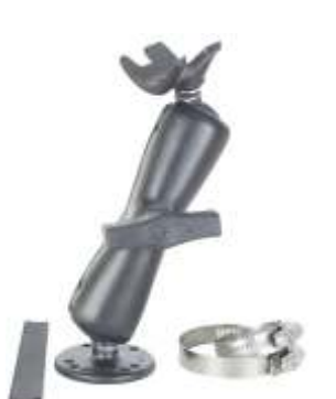
RAM-109-1APU RAM SINGLE SWING ARM FOR PEDESTAL SYSTEMS