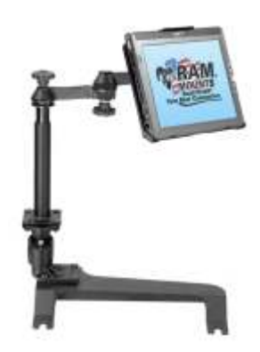
RAM-VB-131R4-SW1 VEHICLE SYSTEM FOR THE 2000-NEWER 2500 & 3500 SU POWER