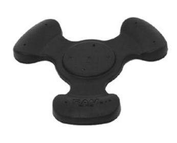
RAP-288PU RAM 45 DEGREE ADJUSTABLE BASE WITH FEMALES FOR PIPE