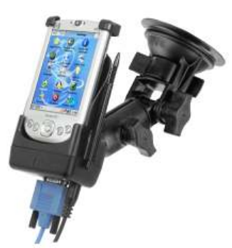
RAP-B-104-224-GA10 RAM RATCHET/PIVOT MOUNT FOR THE GARMIN IQUE