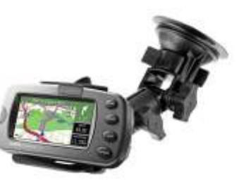
RAP-B-104-224-GA9 RAM RATCHET/PIVOT MOUNT FOR THE GARMIN 2610