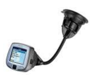
RAP-105-6224-GA22 RAM FLEX ARM MOUNT FOR THE GARMIN STREETPILOT I SERIES