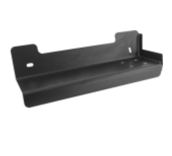
RAM-VB-105-MOT2 VEHICLE SYSTEM FOR THE 1997-NEWER DAKOTA & DURANGO