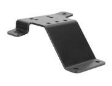
RAM-VBD-128-MOT4 RAM UNIVERSAL DRILL TYPE FLAT VERTICAL BASE