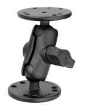
RAM-B-101-G1 RAM MOUNT WITH MOUNTING HARDWARE