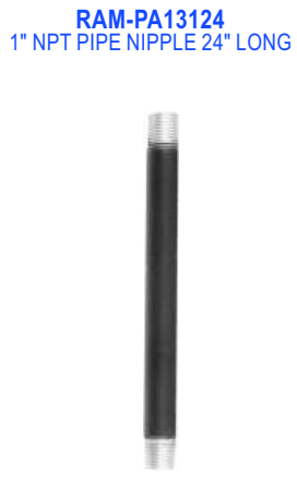
RAM-PA5412 1/4" X 12" LONG PIPE NIPPLE ALUMINUM