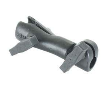
RAM-201-D RAM DOUBLE SOCKET ARM C BALL D LENGTH