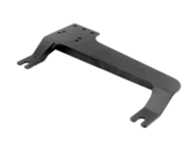
RAM-VB-131R4 VEHICLE BASE FOR THE 2000-NEWER 2500 & 3500 SU POWER