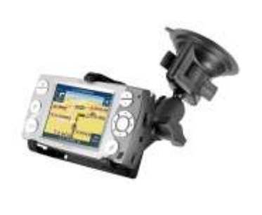
RAM-B-166-UN1 RAM UNIVERSAL SUCTION MOUNT FOR SMALL SIZE DEVICES