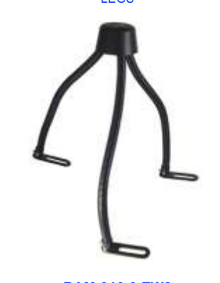
RAM-316-3-TW2 RAM POD III WITH SWING ARM & 202