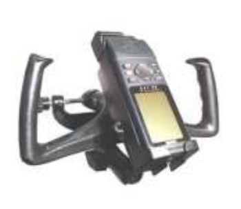
RAM-B-126BU RAM WINDSHIELD MIRROR BRACKET