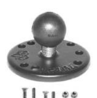
RAM-B-202U-275 275 BULK PACKAGED 2-7/16"