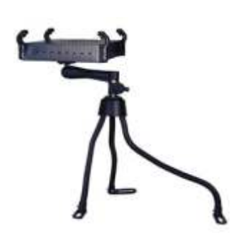
RAM-316-TU RAM POD III 1/2" PIPE POST