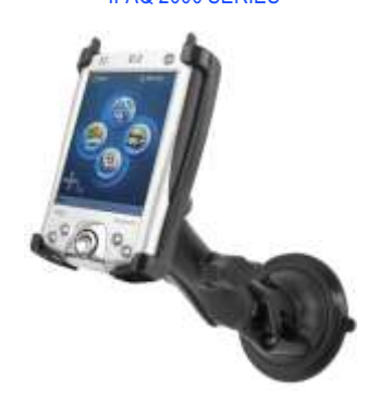
RAM-B-166-CO5P RAM SUCTION MOUNT POWERED IPAQ FAMILY