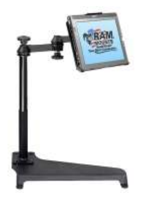
RAM-VB-150-SW1 VEHICLE SYSTEM FOR THE 2005-NEWER SCION XB