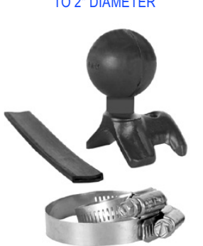
RAM-109-1ASU RAM SINGLE SWING ARM STRAIT EXTENTION