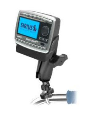
RAM-B-166 RAM SUCTION MOUNT TWIST LOCK