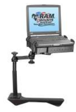
RAM-VB-131A-SW1 VEHICLE SYSTEM FOR THE 2000-NEWER HUMMER H2