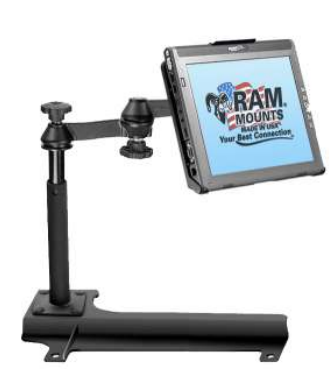
RAM-VB-159-SW1 VEHICLE SYSTEM FOR THE 2007 CHEVY TAHOE