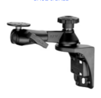
RAM-109V-3U RAM SWING ARM WITH VERTICAL BASE & BALL