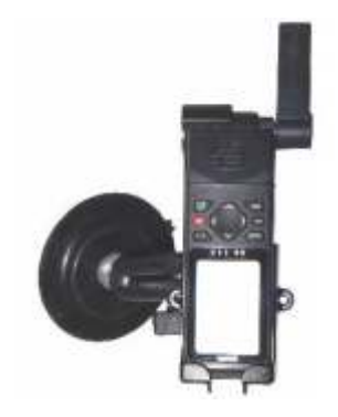
RAM-B-148-GA7 RAM SUCTION MOUNT FOR THE GARMIN 176, 276, 296