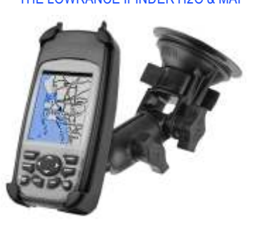
RAP-B-104-224-LO3 RAM RATCHET/PIVOT MOUNT FOR THE LOWRANCE IFINDER H2O & MAP