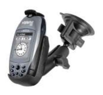
RAM-B-166-PD2 RAM SUCTION MOUNT THREE FINDER PDA HOLDER