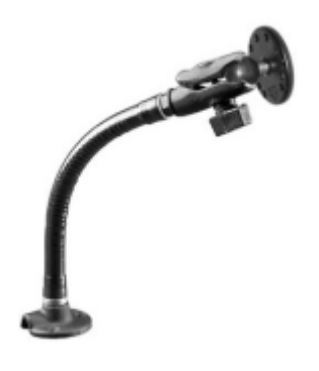
RAM-B-125-GA3 RAM YOKE MOUNT WITH CRADLE GARMIN 89, 90,92