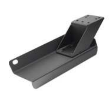
RAM-VB-117-PAN1 VEHICLE SYSTEM TOUGH DOCK