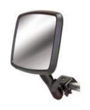
RAM-B-127B RAM WINDSHIELD MOUNTING BASE