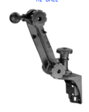
RAM-201 RAM DOUBLE BALL SOCKET ARM ASSEMBLY