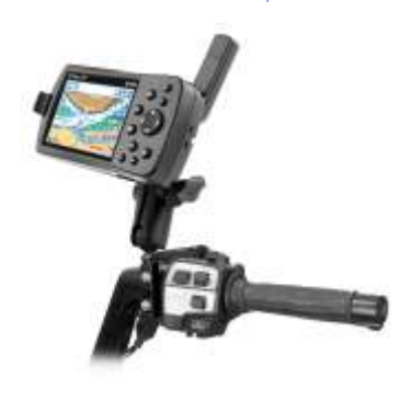
RAM-B-174-LO2 RAM BRAKE/CLUTCH RESERVOIR FOR THE LOWRANCE IFINDER