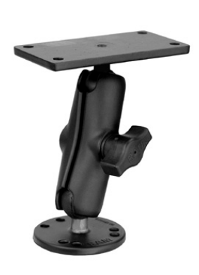
RAM-B-101-A-24U RAM MOUNT WITH 1 2" X 4" BASE & 1 SHORT ARM