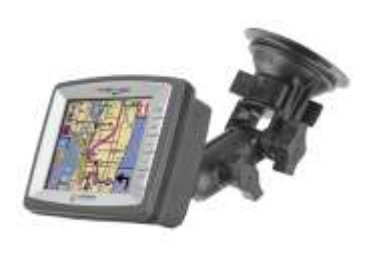
RAP-B-104-224-LO4 RAM RATCHET/PIVOT FOR THE LOWRANCE IWAY 500C