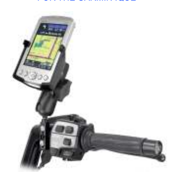
RAM-B-174-GA15 RAM BRAKE/CLUTCH RESERVOIR FOR THE GARMIN QUEST