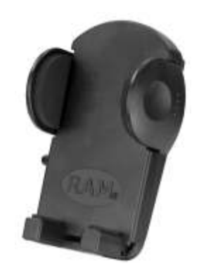
MADE IN USA Your Best Connection