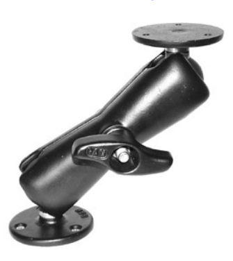
RAM-D-101U-C-243 RAM MOUNT WITH D-243, D-201-C, D-254 & SHORT ARM

RAM-D-101U-C RAM MOUNT WITH 2 3.68 BASES & C