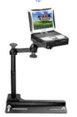
RAM-VB-108-SW1 VEHICLE SYSTEM FOR THE 2000-NEWER EXCURSION & 1999-NEWER F250