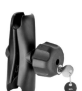
RAM-202C RAM BALL BASE WITH 3/8" -16 STST STUD