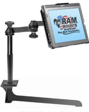
RAM-VB-155-SW1 VEHICLE SYSTEM FOR THE 2006-NEWER HONDA CIVIC