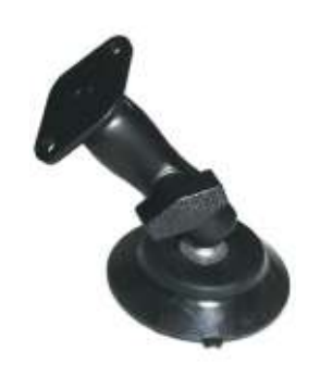
RAM-B-148-CO4 RAM SUCTION MOUNT FOR THE 1900 AND 4100 SERIES