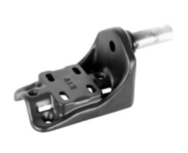
RAM-316-3AU RAM POD III WITH STUD LENGTH LEGS