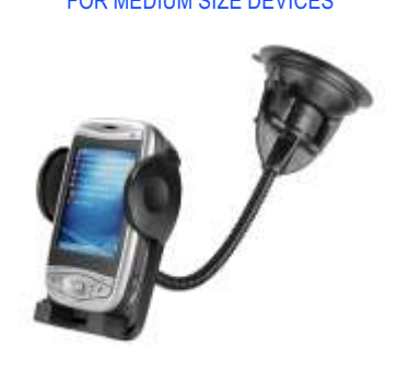
RAP-105-6224-UN2 RAM UNIVERSAL FLEX ARM MOUNT FOR MEDIUM SIZE DEVICES