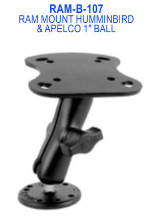
RAM-B-108 RAM WITH STUD BASE & V BASE WITH STRAPS 1/2-2