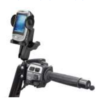
RAM-B-175-A-GA5U RAM ETREX B/W WITH SEGWAY SHORT ARM