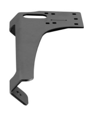
RAM-VBD-101 DRILL TYPE VEHICLE BASE