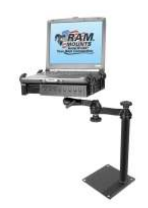
RAM-VBD-128 RAM UNIVERSAL DRILL TYPE FLAT VERTICAL BASE