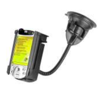
RAP-105-6224-CO4 RAM FLEX ARM MOUNT FOR THE IPAQ 1900 & 4100 SERIES