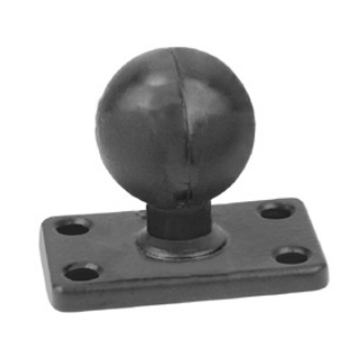
RAM-202U-225 RAM BASE 2" X 2.5" WITH 1 1/2" BALL