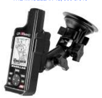
RAP-B-104-224-MA1 RAM RATCHET/PIVOT MOUNT FOR THE MAGELLAN 12, 300 & 315