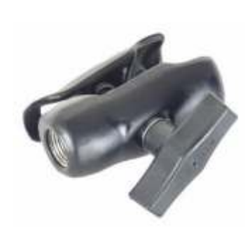
RAM-201-B RAM DOUBLE SOCKET ARM C BALL B LENGTH