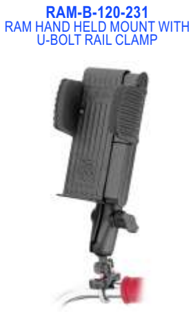
RAM-B-121-202U RAM MOUNT WITH RAM-B-121, B-201, & B-202