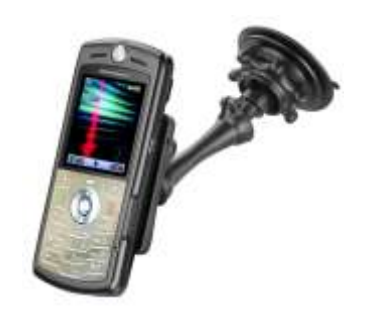
RAP-B-101-2241-OT1U RAM MOUNT WITH TWIST LOCK CUP