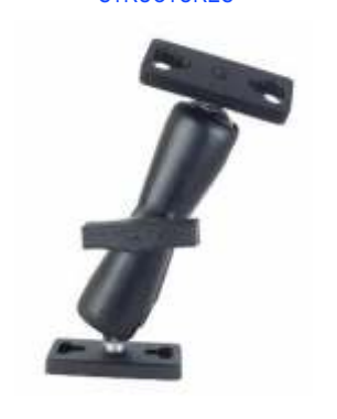
RAM-160-2U-RF1 RAM SEAT RAIL SYSTEM WITH 2 SWING ARMS NO KNOB