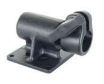
RAM-D-246PU VESA PLATE WITH 1" POST