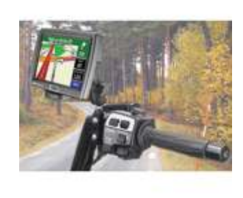
RAM-B-174-GA12 RAM BRAKE/CLUTCH RESERVOIR FOR THE GARMIN 60 SERIES