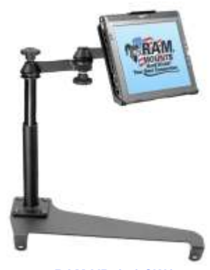
RAM-VB-154-SW1 VEHICLE SYSTEM FOR THE 2004- NEWER NISSAN PATHINDER & XTERRA