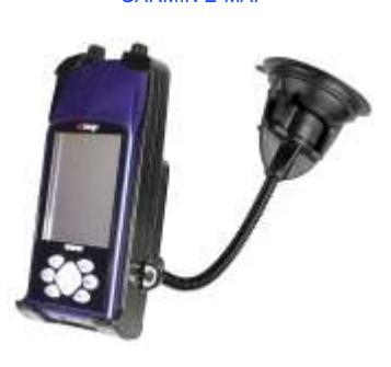
RAP-105-6224-GA4 RAM FLEX ARM MOUNT FOR THE GARMIN E-MAP