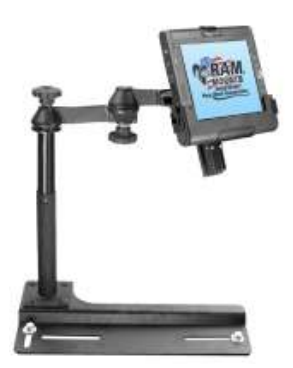
RAM-VB-107-PAN1 VEHICLE SYSTEM TOUGH DOCK