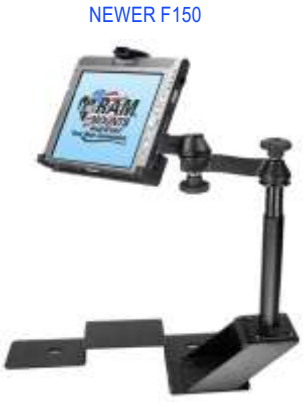
RAM-VB-110-SW1 VEHICLE SYSTEM FOR THE 1997-03

RAM-VB-109-MOT3 VEHICLE SYSTEM FOR THE 2004-